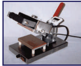
Easy Seal Heat Press $1425.00 each