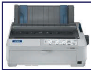
Epson FX Printer $600.00 each

Complete package valued at over $2600.00