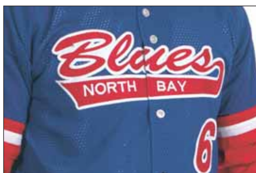
Cross Placket Tackle Twill