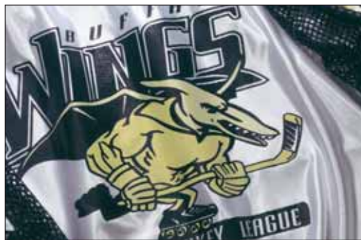
Direct Screen Print