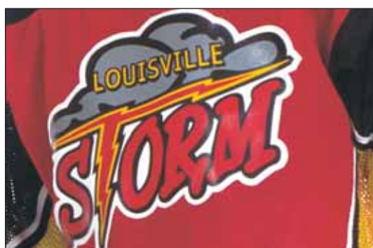
Screen Print on Tackle Twill