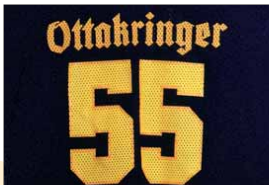
Screen Print Numbers