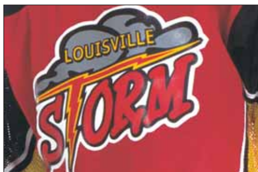
Screen Print on Tackle Twill