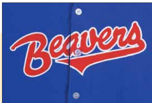
Cross Placket Screen Print