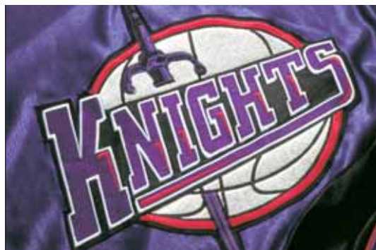
Embroidery on Tackle Twill