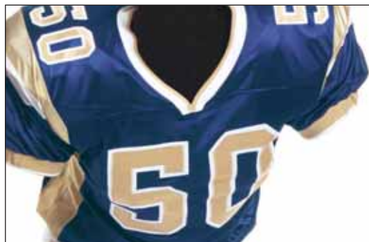
Tackle Twill Numbers